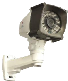
Dimension Unit : mm

Sony Exmor 1.4MP/2.4MP Image Sensor Camera